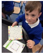
Learning about shapes

We have been making cakes for the MacMillan Cake sale. We had lots of fun learning about how chocolate is melted and how we use money.